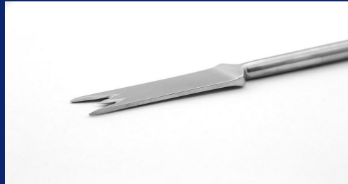
TM Peg Cutter