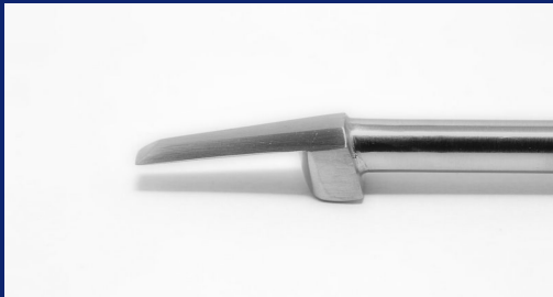
Straight Angled blade Short/medium/long