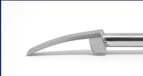
Curved blade short/medium/long