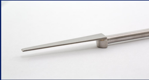
Flat Straight blade short/medium/long/x-long