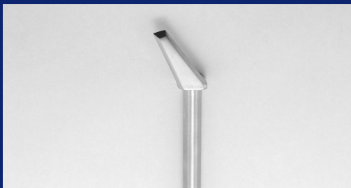
Angled Left and Right